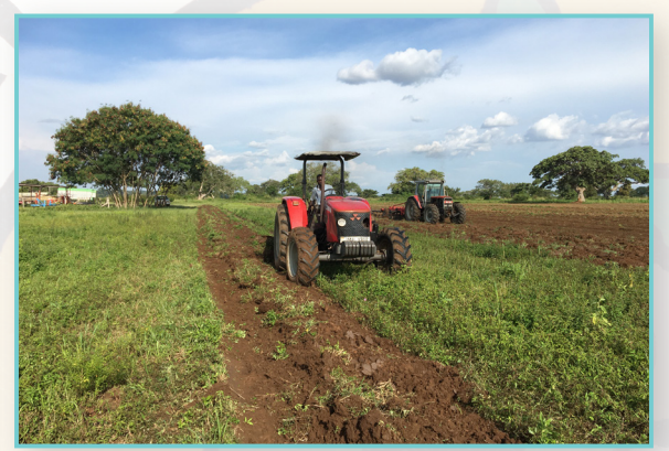
Plowing the fields