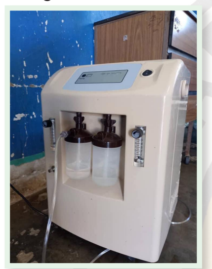
3x Oxygen 5 x Pulse Oximeters 5 Suction Machines. Nasal prongs and tubing. Soap for hand washing.

Following a request from Kumi Hospital for support during the pandemic and through a recent long period of drought, KCF was happy to supply the following.