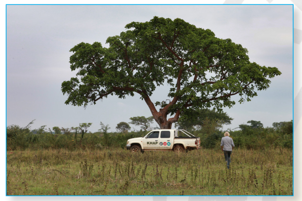
Control of the pastures

Like all Teso farmers KHAP experienced the adverse effects of the prolonged dry spell and erratic rains in 2021. The maize harvest completely failed due to drought, diseases and army worm infestation. Sorghum did better, especially in the second season from July-November. different types of grass had been planted to test drought resistance and palatability. The conclusion is that Mulato grass is suitable to plant additional paddock. Till November 2021, around 47 ha (117 acre) of land is covered with Mulato graas now and the milk production is increasing.